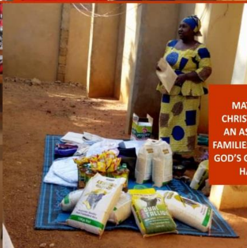
2018 MATTHEW 25:35 CHRISTMAS PROJECT: AN ASSISTANT TO 52 FAMILIES OF THE RETIRED GOD'S GENERALS OF THE HAUSA LAND